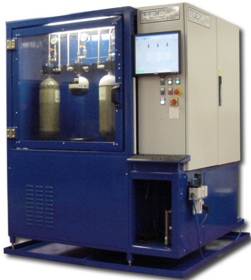
Hydraulic cycling test of gas cylinders @ 450bar, system complete with full data monitoring. Typical test carried out for up to 20,000 cycles.