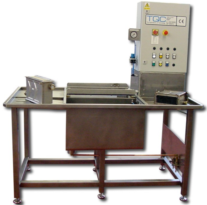
Heat exchanger test benches using air under water and pressurised water (with fluorescent dye). Both units with safety interlocked proof pressure test prior to leak testing via manual inspection.