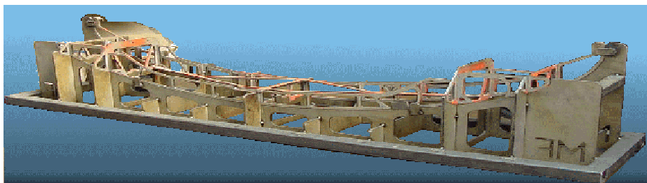
Jig in Assembly / Checking Fixture